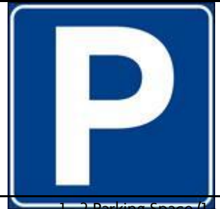
1 - 2 Parking Space (1 - 2)

Quarterly rents Please call for availability