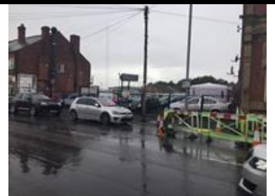
0.27 Acres (0.11 Hectares)

main road location Please contact our office for further information